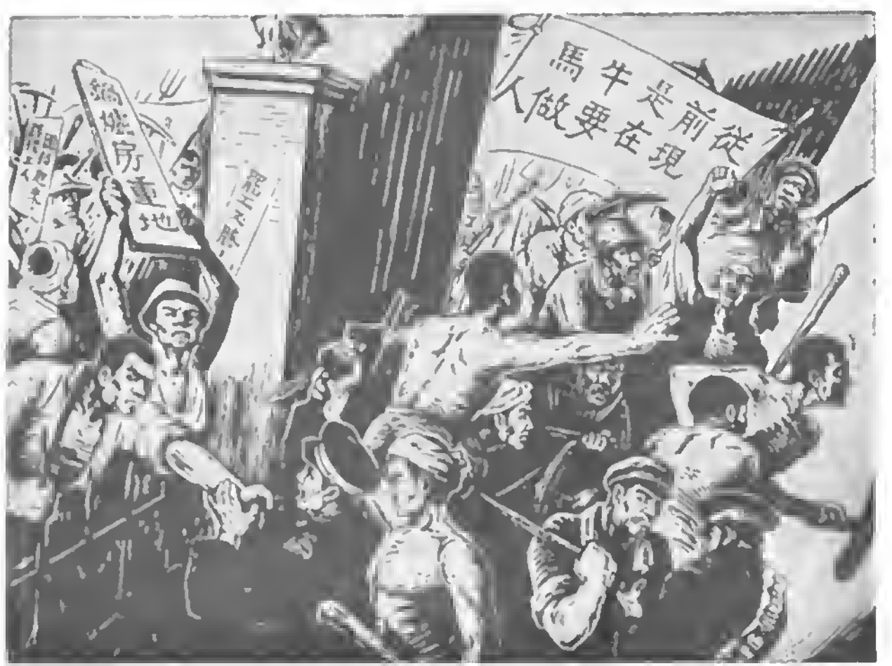
Workers fight hand to hand with reactionary troops and police.

visited the workers in their huts to awaken their proletarian eon-sciousness. Their sufferings, he told them, certainly were not "fate" or "destiny" but the result of the oppression and exploitation of the foreign imperialists and domestic capitalists. He helped them understand that so long as the workers organized, they could overthrow the exploiters and build a new world in which the working people were their own masters.